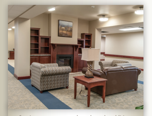
Spacious common areas throughout the additions were designed to foster a sense of community.

After initial attempts stalled when the resident-owners and architects could not agree on an affordable vision, Green Hills decided to consult with Story Construction about using the design-build construction delivery method, which welcomes owner participation while enabling the design-builder to contribute ideas and provide architectural and construction oversight throughout the process. Thanks to the collaborative nature of the system, the entire design and construction of the project was completed in just over a year and Green Hills residents are now enjoying their new living spaces and wellness center.