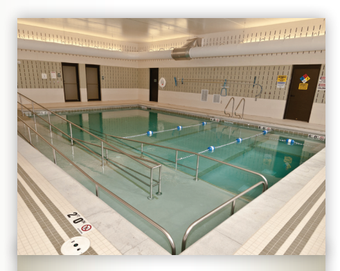
The warm-water pool in the new wellness center is a venue for a variety of aquatic therapy classes.