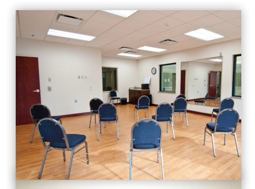
Multi-purpose rooms in the wellness center are used for fitness classes and nutritional counseling.