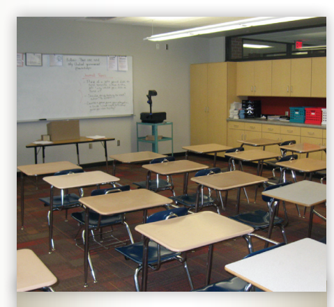
A $9.3 million renovation of the entire John Adams Middle School building improved educational space.